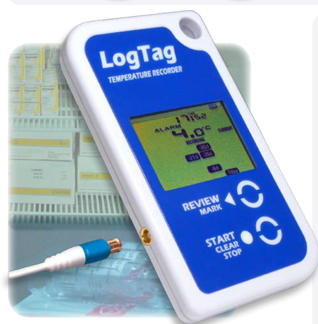
Part codes TRED30-7R, TRED30-7F

The LogTag<sup>®</sup> TRED30-7 Temperature Recorder measures and stores up to 7770 temperature readings over -40°C to +99°C (-40°F to +210°F) measurement range from a remote temperature probe.